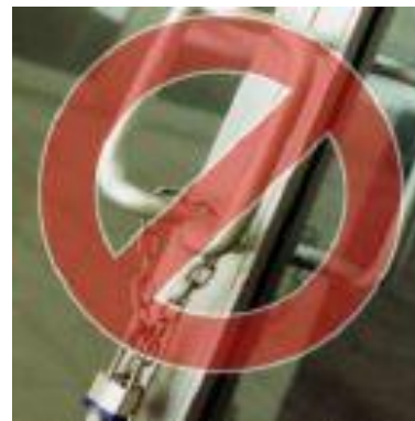
‘Enforcement not OK’

This decision can be criticised for unrealistic ‘dancing on a pinhead logic’. But it is a leading judgement which advances the cause of arbitration in the field of cross-border insolvency.